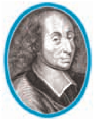
Blaise Pascal (1623-1662)

In earlier classes, we have learnt how to find the squares and cubes of binomials like a + b and a - b . Using them, we could evaluate the numerical values of numbers like (98)^2 = (100 - 2)^2 , (999)^3 = (1000 - 1)^3 , etc. However, for higher powers like (98)^5 , (101)^6 , etc., the calculations become difficult by using repeated multiplication. This difficulty was overcome by a theorem known as binomial theorem. It gives an easier way to expand (a + b)^n , where n is an integer or a rational number. In this Chapter, we study binomial theorem for positive integral indices only.